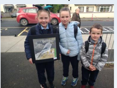
Yellow Flag Committee

Here we have our own artistic prize winner. Well done.