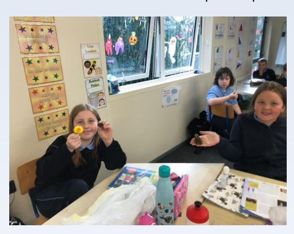
Outdoor learning is the way to go!

A great way for the committee to start their work was to explore their local natural environment. The class went on a nature walk up to the park.