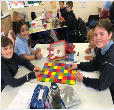
Maths Week 2020 went ahead as usual.