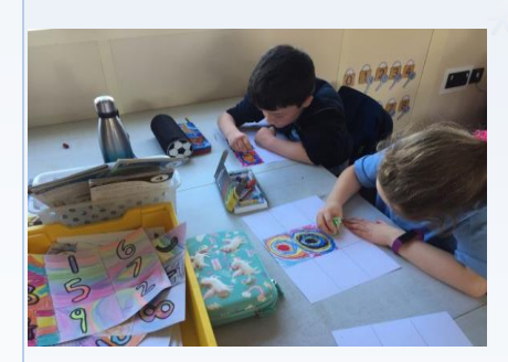
Art by 2<sup>nd</sup> class learning about patterns.